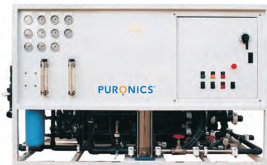
MODEL 15C 21,600 GPD of High Purity Water

Puronics® really understands water. While the structure, H 2 O, is deceptively simple, the solutions to purifying water are not. Whether you are a commercial or industrial client, you can trust Puronics® to provide fully integrated water solutions for managing your most important liquid asset.