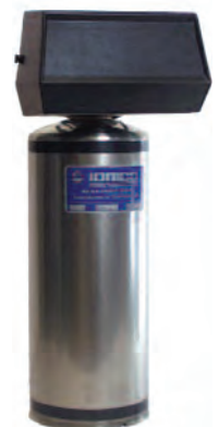
Model HT Hot Water Conditioner