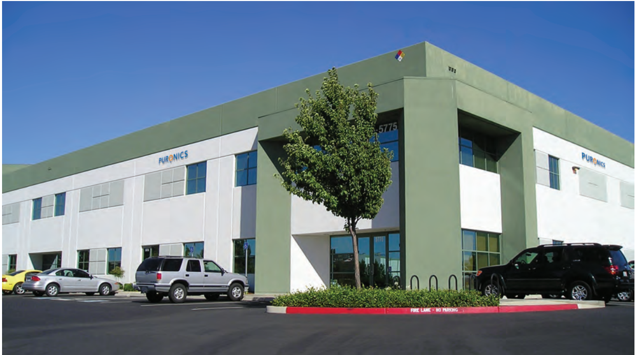
Puronics® World Headquarters, Livermore, California

A leader in water treatment solutions, Puronics oversees its premier manufacturing operations and supports a national sales and service network from its worldwide headquarters in Livermore, California. Puronics provides customer sales and service through a nationwide network of corporate-owned locations and independent dealers. Our 25,000 square foot manufacturing facility is designed for efficient fabrication and assembly of our water treatment equipment within a stringent quality-controlled environment.