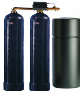
TW Series Water Conditioner